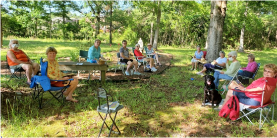
The North Carolina Associate Community

When trying to maintain social distancing, what better way to meet than in the back yard of your parish? St. Brendan's has an area that one of our Eagle Scouts created as an Inspiration Garden and we decided that it provided us with a great opportunity to see one another. We prayed, shared stories about our recent experiences, shed a few tears since some of us have lost relatives to the COVID-19 virus, and continued our discussion of "Build With Living Stones."