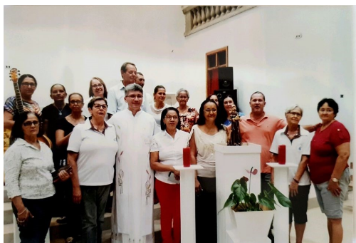
Porangatu & Novo Planalto-Goiás