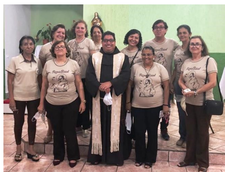
Pires do Rio-Goiás