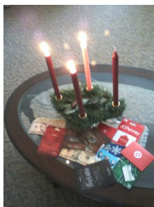
Grocery store gift certificates for this year's "adopted" family