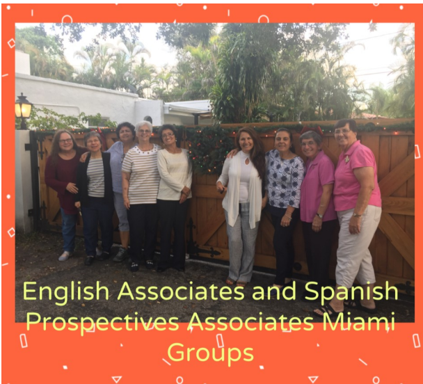
English Associates and Spanish Prospectives Associates Miami Groups