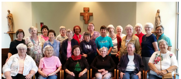
Tampa Bay area Sisters and Associates in the Chapel at St. Elizabeth Convent